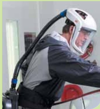
Eye and Face Protection